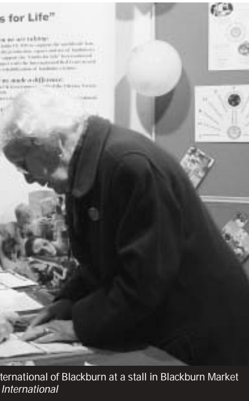
International of Blackburn at a stall in Blackburn Market Soroptimist International

2003 has been no exception, and has seen innovative ideas for campaigning and awareness raising of the 'Clear Up! Campaign' launched last March at the Imperial War Museum. The Campaign has been featured in Soroptimist publications and via the internet information has spread around the world.