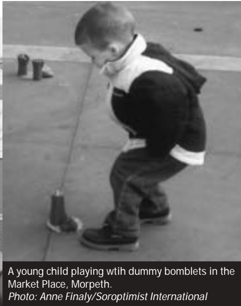
A young child playing with dummy bomblets in the Market Place, Morpeth.

The Soroptimist Federation of Great Britain & Ireland comprises 398 clubs in 30 countries and at a recent conference at The Belfast Waterfront Hall unanimously passed the resolution proposed by Yvonne Jacques from Soroptimist International of Chelmsford : "Members are urged to call upon their Governments to extend the ban on landmines to include the use of cluster bombs."