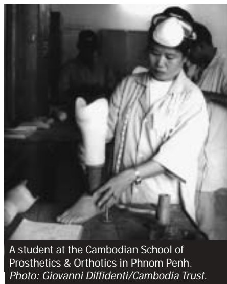
A student at the Cambodian School of Prosthetics & Orthotics in Phnom Penh.

Fifteen years on the Trust's work has grown far beyond its initial objectives. In response to the wider disabled population, the three clinics have evolved into full rehabilitation centres providing support for all mobility-impaired disabled people. The clinics provide artificial limbs, orthopaedic braces, wheelchairs, physiotherapy and counselling. As well as landmine