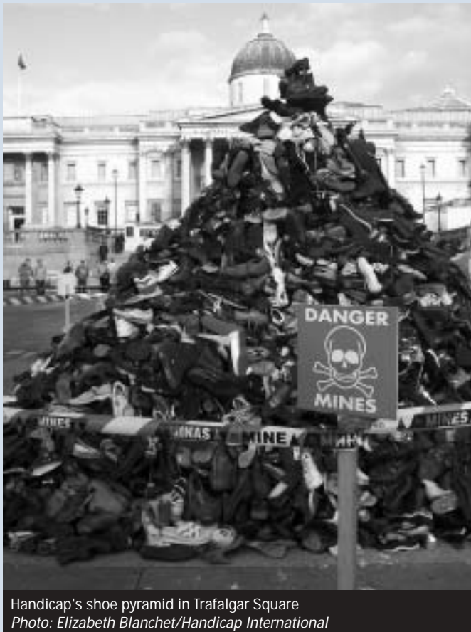
Handicap's shoe pyramid in Trafalgar Square

The focus of Landmine Action Week 2003 was cluster bombs and other explosive remnants of war. The aim was to increase awareness of the issue and to gain more signatures for the Clear Up! Campaign petition.